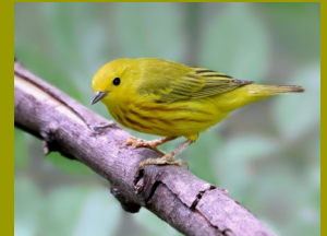
Yellow Warbler by Debbie McKenzie

The Lancaster County Conservancy's 46 nature preserves have just received designation from the Audubon's Bird Habitat Recognition Program. Protected properties include popular preserves such as Kellys Run, Shenks Wildflower Preserve, Tucquan Glen, Climbers Run, the Conoy River Buffer, and Welsh Mountain Nature Preserve. Public signage will be erected at all of the Preserves over the next year. The Conservancy's Nature Preserves are areas set aside and managed to create habitat and food sources for countless birds.