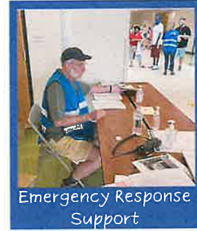
Emergency Response Support