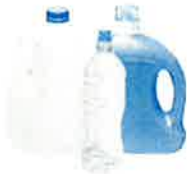
Plastic Bottles & Jugs Botellas y receptáculos de plástico