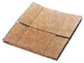
Flattened Cardboard Cartón aplonado

COLOQUE sólo estos artículos en el contenedor de reciclaje