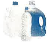
Plastic Bottles & Jugs