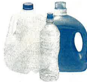
Plastic Bottles & Jugs