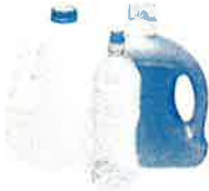
Plastic Bottles & Jugs Botellas y recipientes de plástico