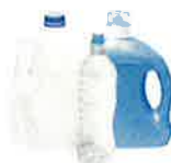
Plastic Bottles & Jugs