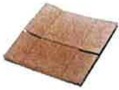
Flattened Cardboard Cartón aplanado

COLOQUE sólo estos artículos en el contenedor de reciclaje